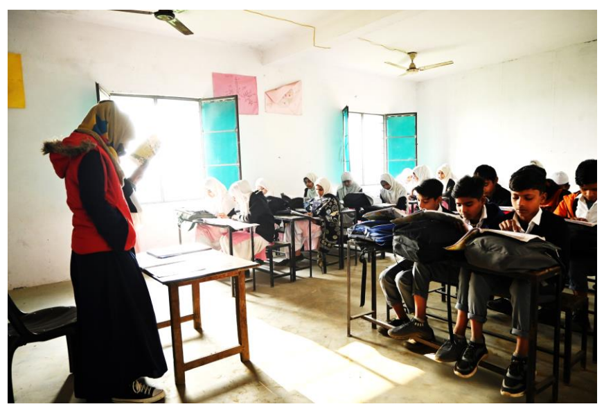
New classrooms built in 2021